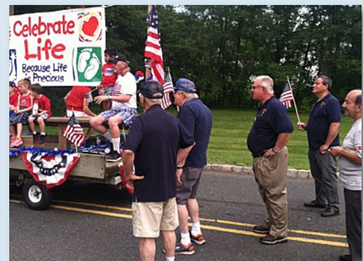
Lined up and ready to march.