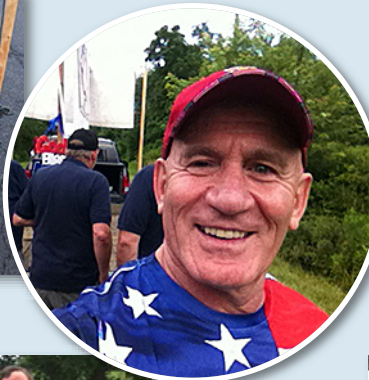
Your photographer provides a selfie.