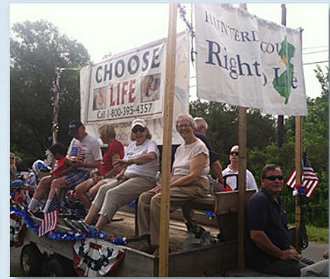
Float completed and riders seated.